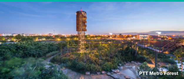
PTT Metro Forest