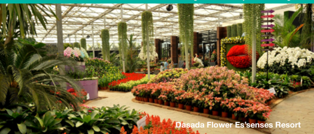
Dasada Flower Es'senses Resort