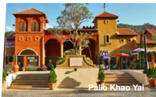
Palio Khao Yai