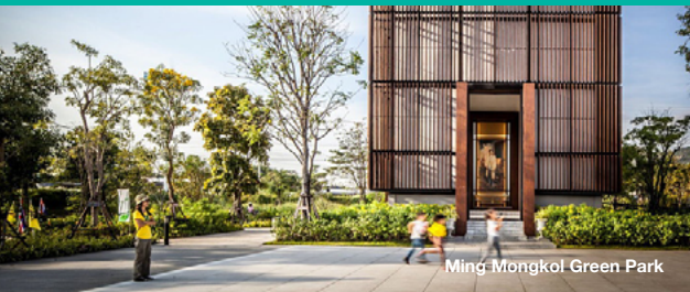
Ming Mongkol Green Park