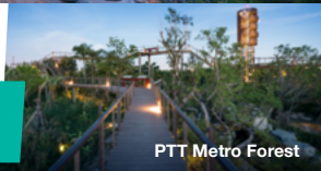
PTT Metro Forest