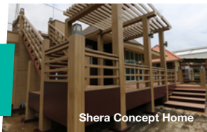
Shera Concept Home