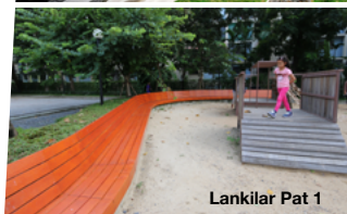
Lankilar Pat 1